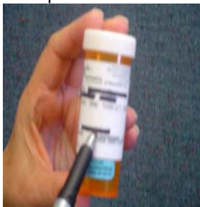
Mark out personal information