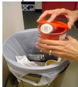
Place in opaque container