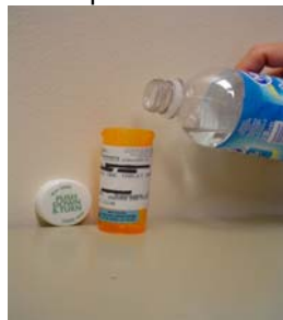
Mix with water and coffee grinds, cat litter, or dirt